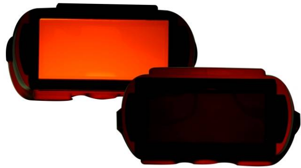
Top: Un-coated viewing goggles visibly fluoresce under high intensity light. Bottom: Anti-glare viewing goggles with dichroic coating

When searching a crime scene using a high intensity coloured light source, the intrinsic fluorescence emitted by standard filtered goggles and camera filters casts a veiling glare over surfaces that decreases the visibility of evidence and in some cases renders the photography of evidence impossible.