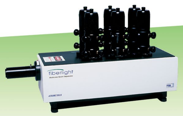
Fiberlight color separator module to be used with Ar-ion laser, DPSS, or fiber laser.